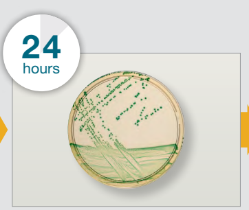
A single Brilliance CCI Agar plate is inoculated using a 10 \mu L loop, before incubating overnight.

Blue-green colonies are presumptive-positive for Cronobacter species.