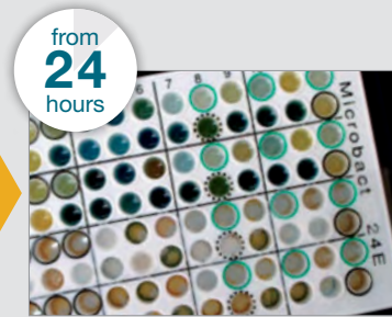
Confirm presumptive-positive colonies with a choice of biochemical gallery (Thermo Scientific<sup>™</sup> Oxoid<sup>™</sup> Microbact<sup>™</sup> GNB 24E or equivalent), PCR test (Thermo Scientific<sup>™</sup> SureTect<sup>™</sup> Cronobacter species PCR Assay) or ISO 16140-6 validated method.

Blue-green colonies are presumptive-positive for Cronobacter species.