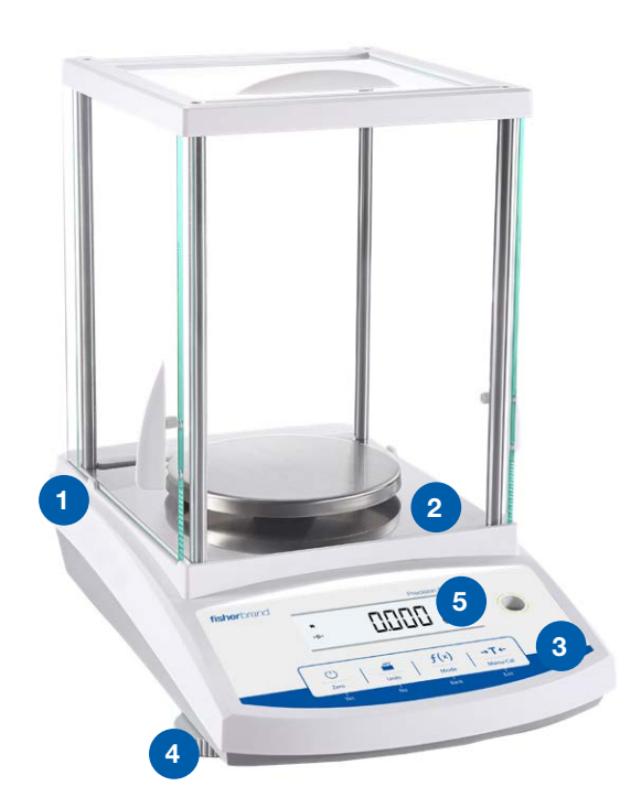
Image above is representative of a precision balance with draft shield**